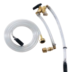
Recirculation Valve Kit Increase descaling power for larger water heaters SC-DS-5-VLV-KIT