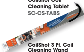
CoilShot 3 Ft. Coil Cleaning Wand SC-CS-WAND